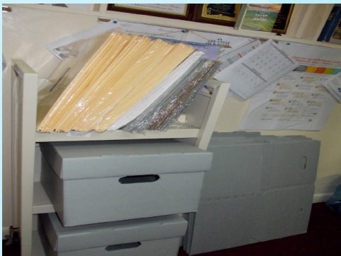
Some of the archival standard boxes, file folders and mylar envelopes