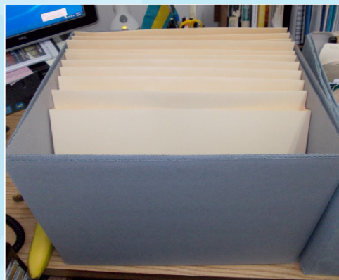
Documents was stored in inconsistently-sized folders. It was hard to retrieve items and the folders were inappropriate for the use.